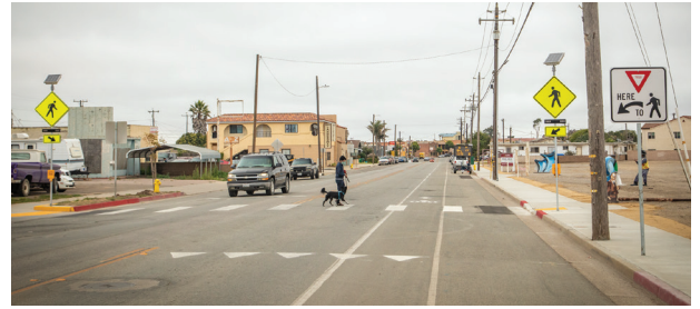
Guadalupe resident walks their dog using the new crosswalk on Guadalupe St.

A nearly half million-dollar pedestrian improvements project along the historic Highway 1 through the City of Guadalupe was completed in June 2020. The project features a new sidewalk on the east side of Guadalupe Street north of the Amtrak station, a crosswalk at Guadalupe Street and 5th Street with flashing beacons, improvements to the crosswalk at Guadalupe Street and 9th Street, including curb extensions (also known as bulb outs) to extend the sidewalk into parking lanes, and improvements to the intersection at 10th St. and Obispo Street, near Mary Buren elementary school.